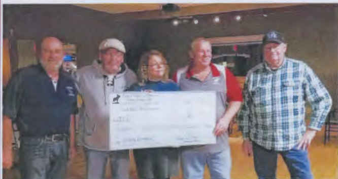
Check presentation to Local VAVS with members of our Board of Officers