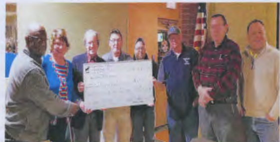
Check presentation to Big Brothers Big Sisters along with members of our Board of Officers