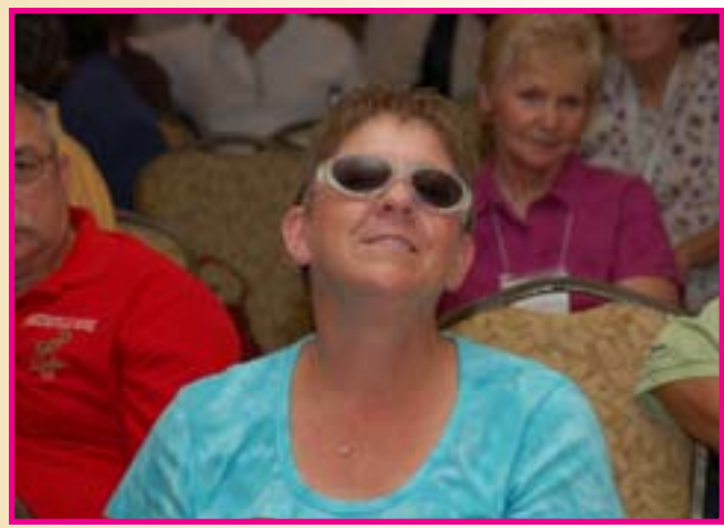
"Ted, I can't do this without a drink!"