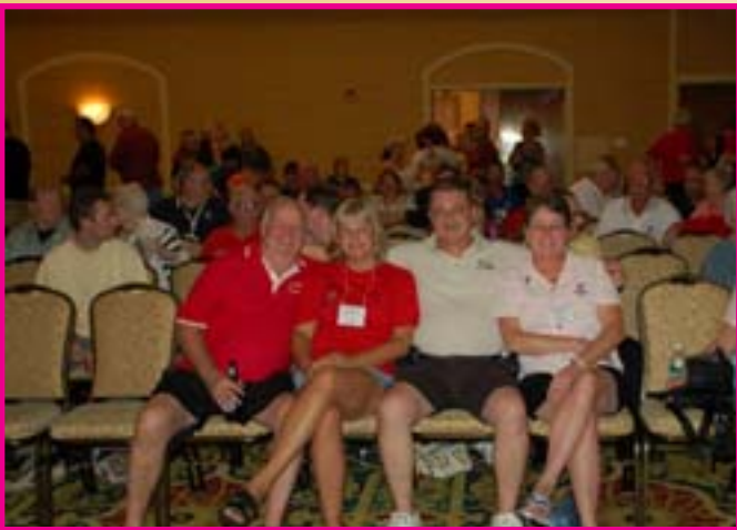
Nah, these guys can't be contestants!