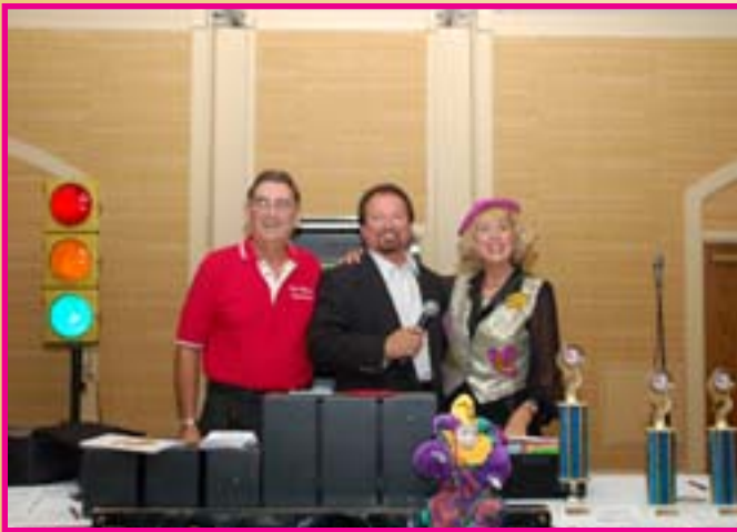
Let's start with the Karaoke team . . .