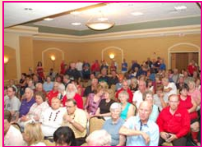
the crowd eagerly awaits the contestants!