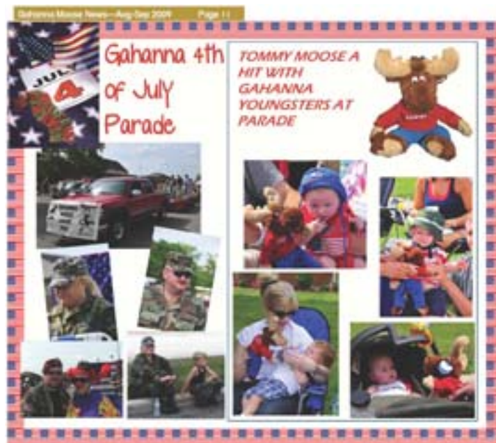
Above is what one Moose Lodge has done for the Tommy Moose Program

Let's think on this issue and figure out a way to take advantage of yet another example of Ohio's largesse!