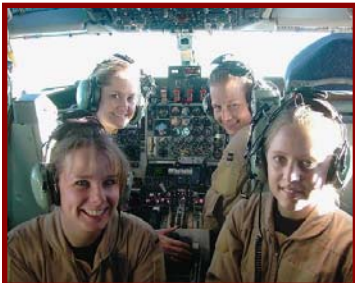
This is the all-female crew of a C-130 which frequently flies into and out of war zones.