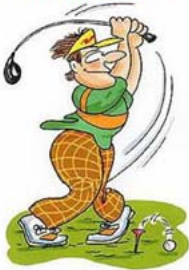
Nuff Said bout Golf