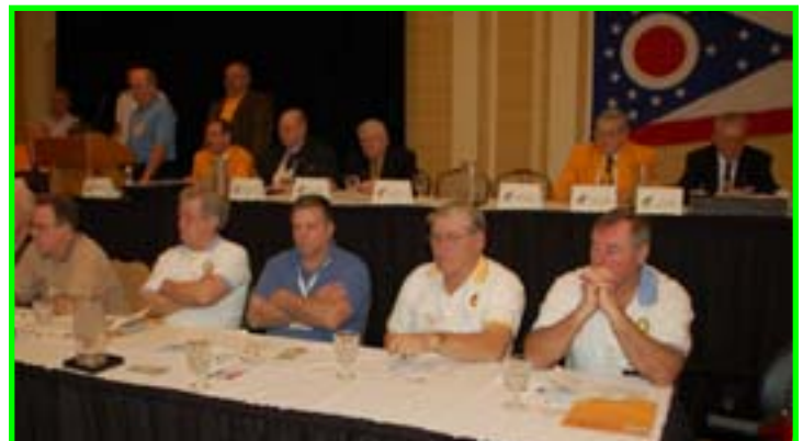
District Presidents play a vital role in the dissemination of information to our lodges.