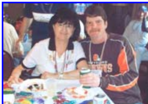
If you've ever visited a hospitality room, then you are keenly aware that you never know just what to expect as the evening progresses!