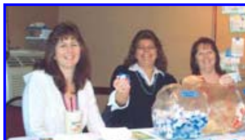
More pixes on next page and more to come in next week's update. ED.