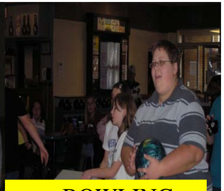
BOWLING & PIZZA PARTY