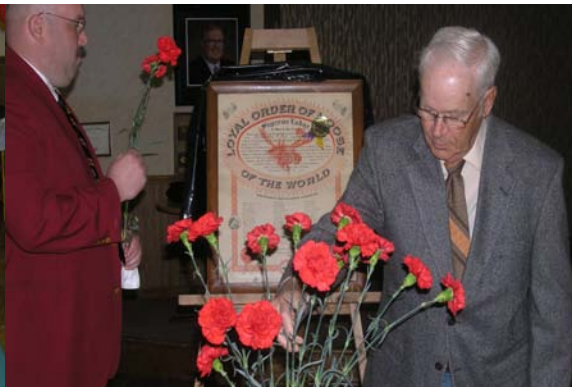
OUR PASSED MEMBERS REMEMBERED