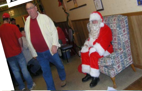
I luv you guys!!