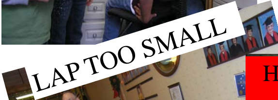
LAP TOO SMALL