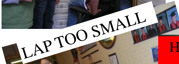
LAP TOO SMALL