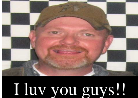
I luv you guys!!