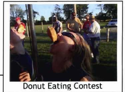
Donut Eating Contest