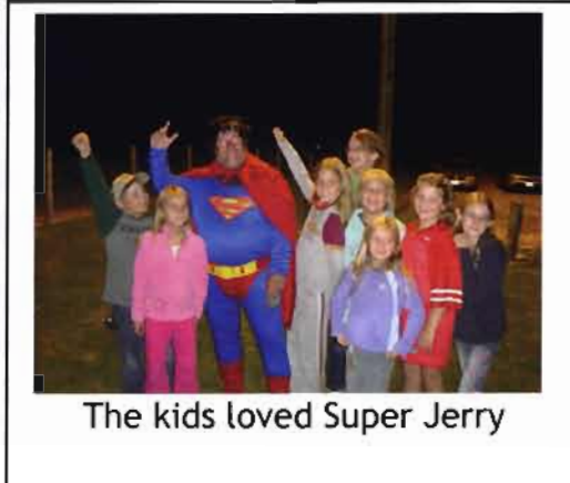
The kids loved Super Jerry